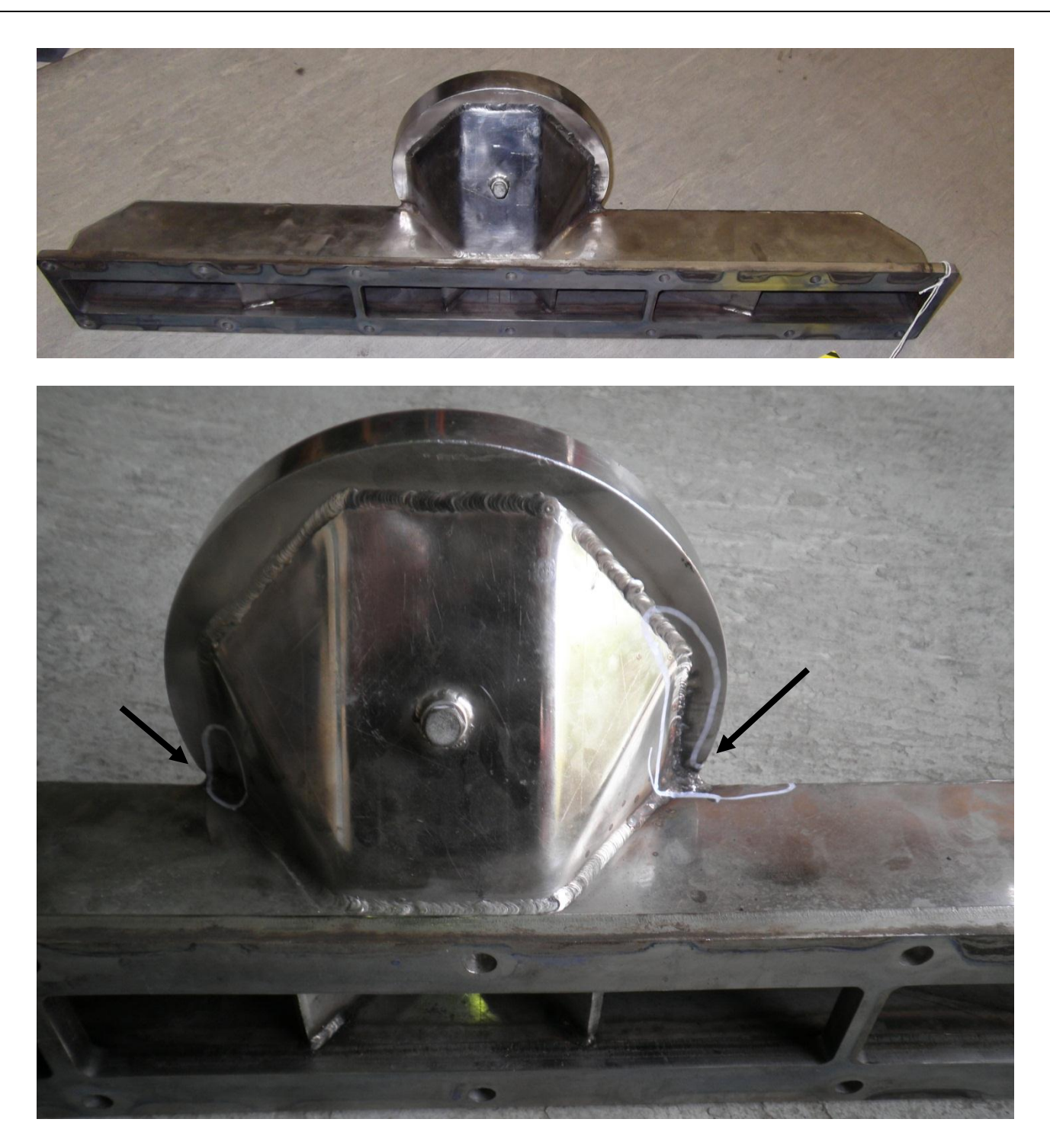
Figure 1: Photographs showing a JUG-A-0 air inlet manifold, highlighting the location at which fatigue cracks have been identified.