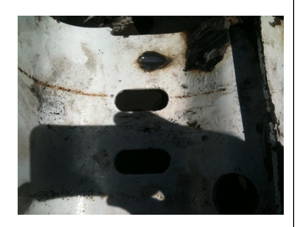
Right Half of Cover depicting contact area

Left half of cover depicting contact area