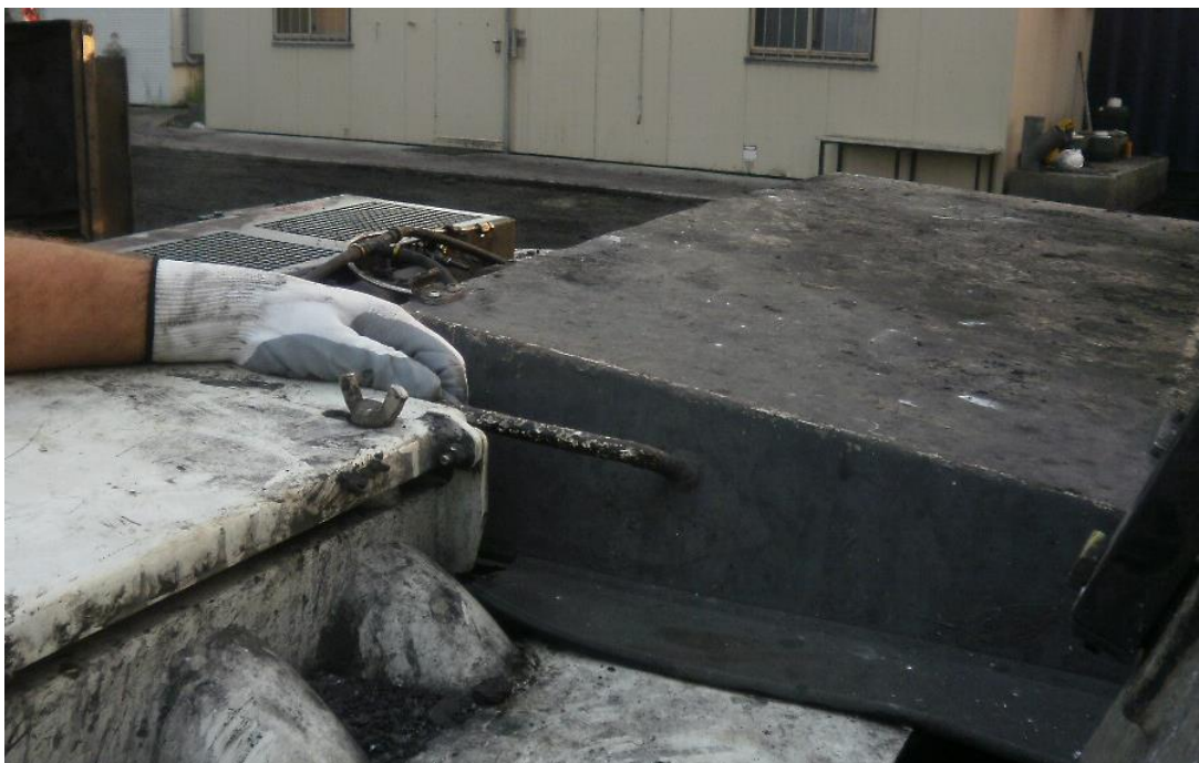
Figure 1 - remove handle & grind back flush to remove burrs. Ensure gas strut is fitted to assist bonnet lift.