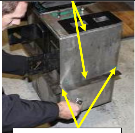
Front surface Maximum deflection 15mm

Front surface measure approximately 270mm down from top