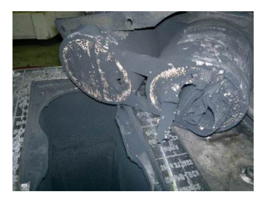
Figure 2: Exhaust Purifier Element Deformation / Damage