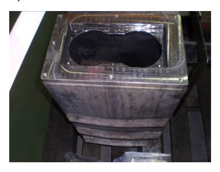
Figure 1: Exhaust Tank Expansion.

It was agreed that a comprehensive Root Cause Analysis (RCA) be conducted and OEM recommendations be made for assessment of scrubber and purifier assemblies in existing MDR 090376 DES systems.