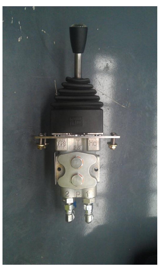
Standard Stick Steer Lever (Mounted in the cabin door)

Please contact your local DMS Product Support Representative to arrange for the mechanical stops to be fitted.