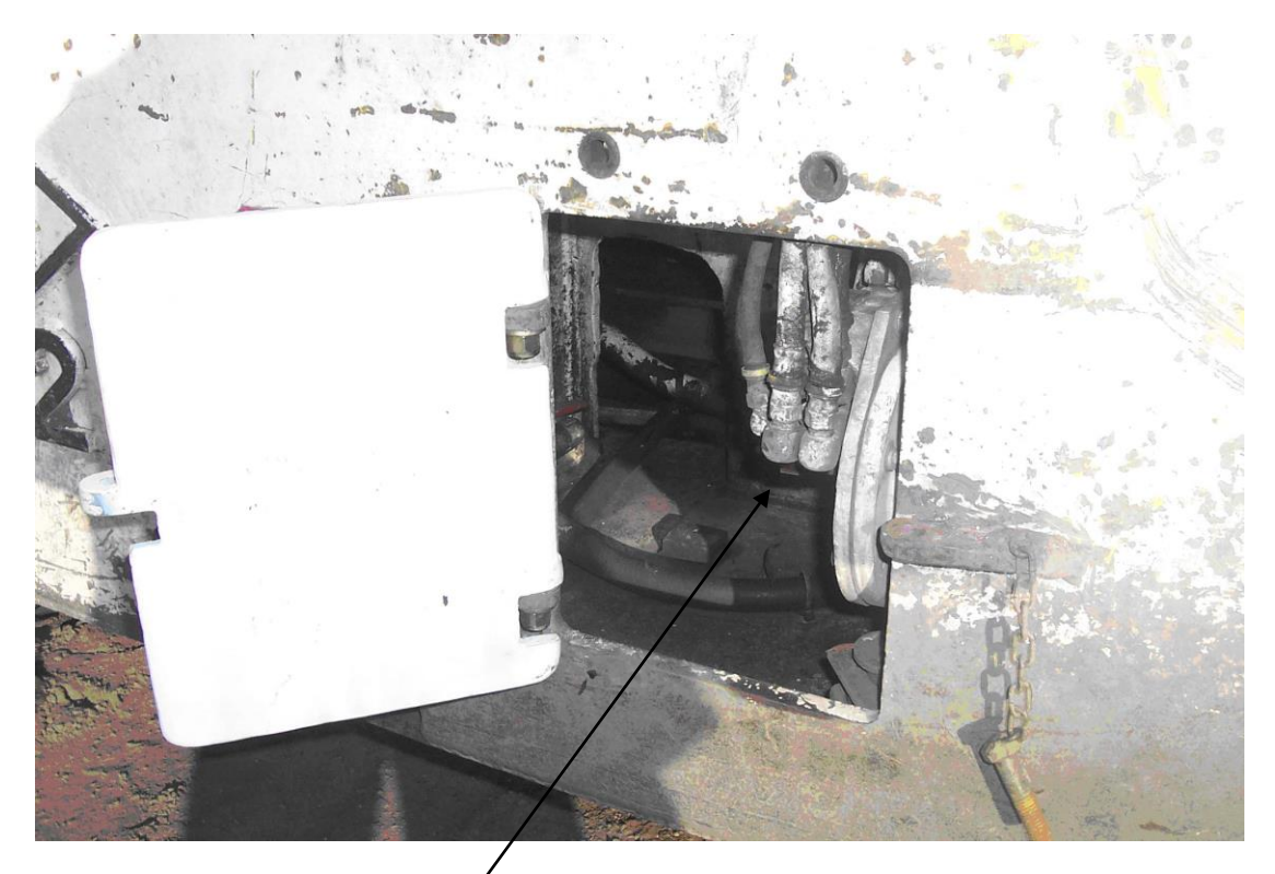
Damaged fittings and cam shaft in this area