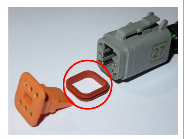
Figure 10 - 6 Pin Plug Seal