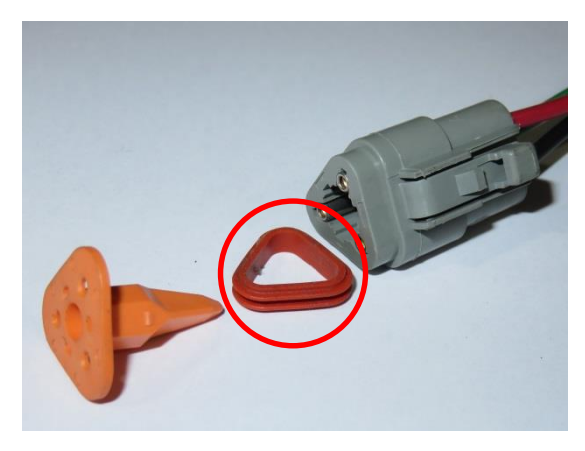
Figure 9 – 3 Pin Plug Seal

PPK recommends thorough cleaning and / or replacement of contaminated Deutsch connectors, seals and blanking plugs to minimise the likelihood particle and fluid ingression which results in erroneous and intermittent faults. The following examples show a Deutsch 3-pin connector plug seal (Figure 9 - Part No: 5520009482), a Deutsch 6-pin connector plug seal (Figure 10 - Part No: 5520009483), a Deutsch 6 Pin Blanking Plug (Figure 11) and correct fitment of the blanking plugs (Figure 12).