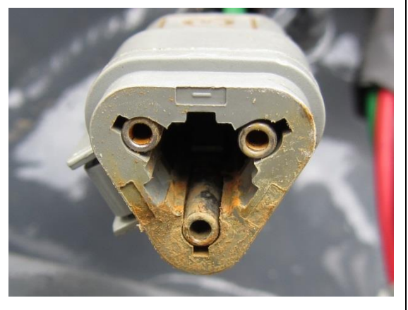
Figure 4 - Liquid Ingression

The following figures show corrosion and contamination (Figures 5 and 6) as a result of the particle and fluid ingression.