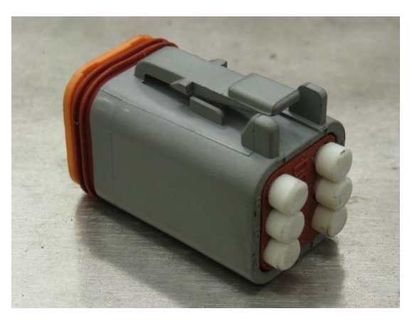
Figure 11 – 6 Pin Blanking Plug