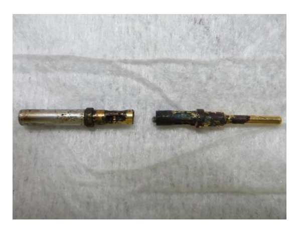
Figure 5 - Corrosion

The following figures show corrosion and contamination (Figures 5 and 6) as a result of the particle and fluid ingression.