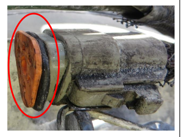
Figure 2 – O-ring