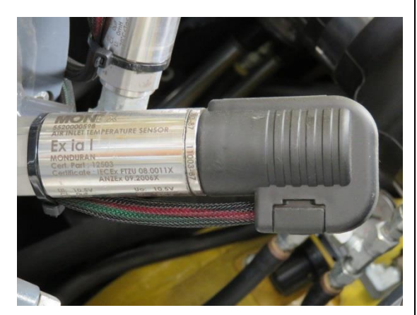
Figure 13 - Sensor Weather Boot