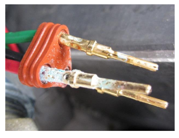
Figure 6 – Corrosion and Contamination

The following figures show missing 6-pin Deutsch connector blanking plugs on the Power Manager (Figure 7) and the resultant contamination (Figure 8) which was causing intermittent faults.