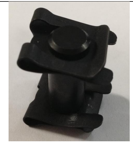
Figure 3: New retaining clips installed on pin