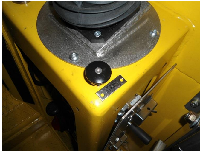
Figure 2: Additional start valve installed (label not fixed)