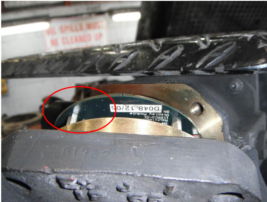
Figure 2: Other OEM Display Unit highlighting the absence of the “JUG” label.

The VLI JUG-A-0 UL/UV explosion protected diesel system includes an exhaust assembly that provides a path for exhaust gases to pass through a wet scrubber, a positive flame trap and finally through DPM filters to atmosphere. The water make-up tank has a low water shut down system, which shuts the machine down when the water level in this tank falls below a preset level. The exhaust scrubber system contains 3 RTD sensors, which provide information to the machine shutdown system. One RTD sensor is fitted close to the raw exhaust inlet, another is between the flame trap and the DPM filters and the last is in the outlet pipe. Should the temperature at any of these locations exceed the preset limit, the machine will shut down.