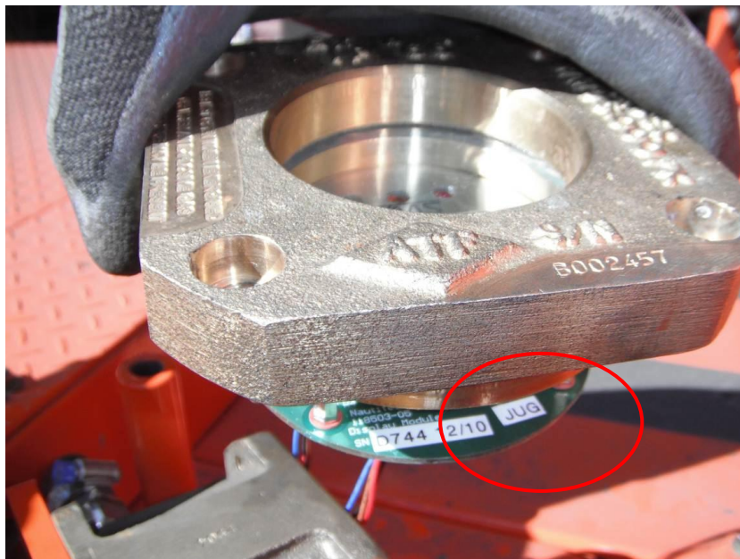
Figure 1: JUG-A-0 Display Unit highlighting the “JUG” label attached to the circuit board.

It has been identified that with regards the physical appearance of the circuit boards, the only difference between the two (2) components is an identification label. The JUG-A-0 circuit board includes a “JUG” label (Figure 1) and the circuit board compatible with other OEM systems will not include this label (Figure 2). Each circuit board will also display a unique serial number; however this does not identify compatibility with the machine shutdown system.