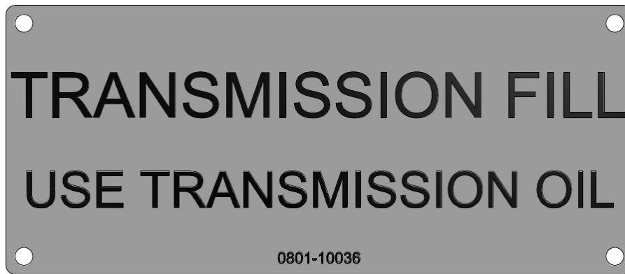
Figure 1: Part No. 0801-10036 – Label – Transmission Fill

Attachment: DANA Spicer Product Service Bulletin (PSB-0271, July 2012)